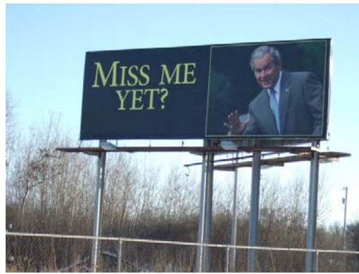
THIS IS A REAL BILLBOARD on I-35, near Wyoming